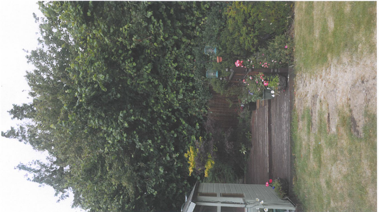
MUNRO CRESCENT, VIEW OF AREA: W1