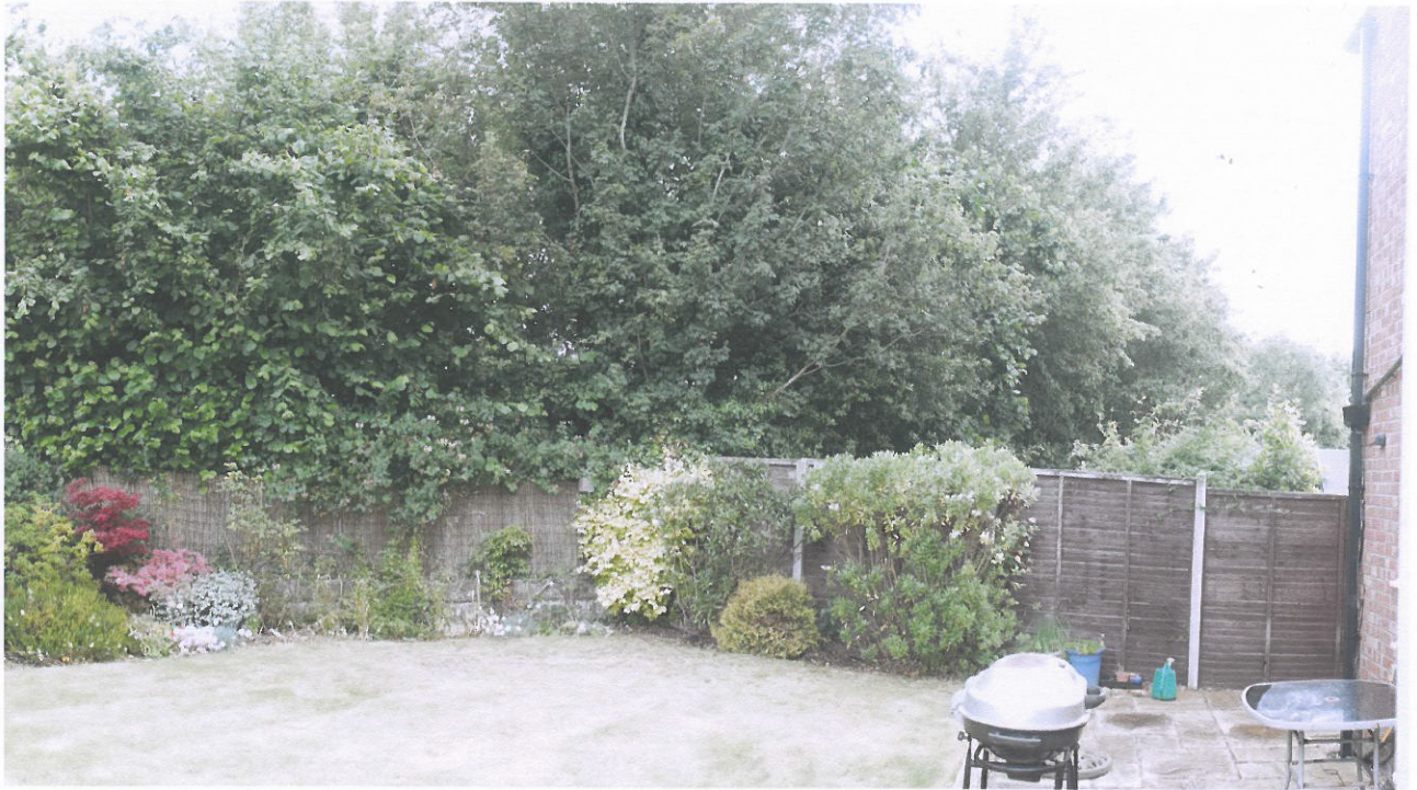
MUNRO CRESCENT, VIEW OF AREA: W1